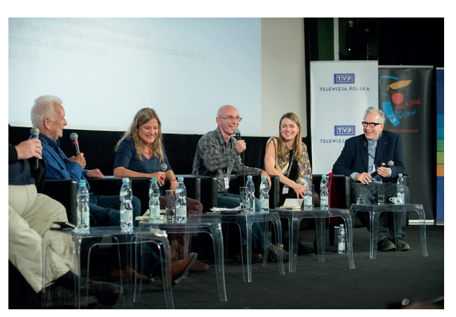
WCOS 3.0 Warsaw